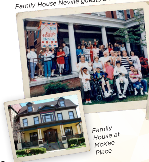
Family House at McKee place